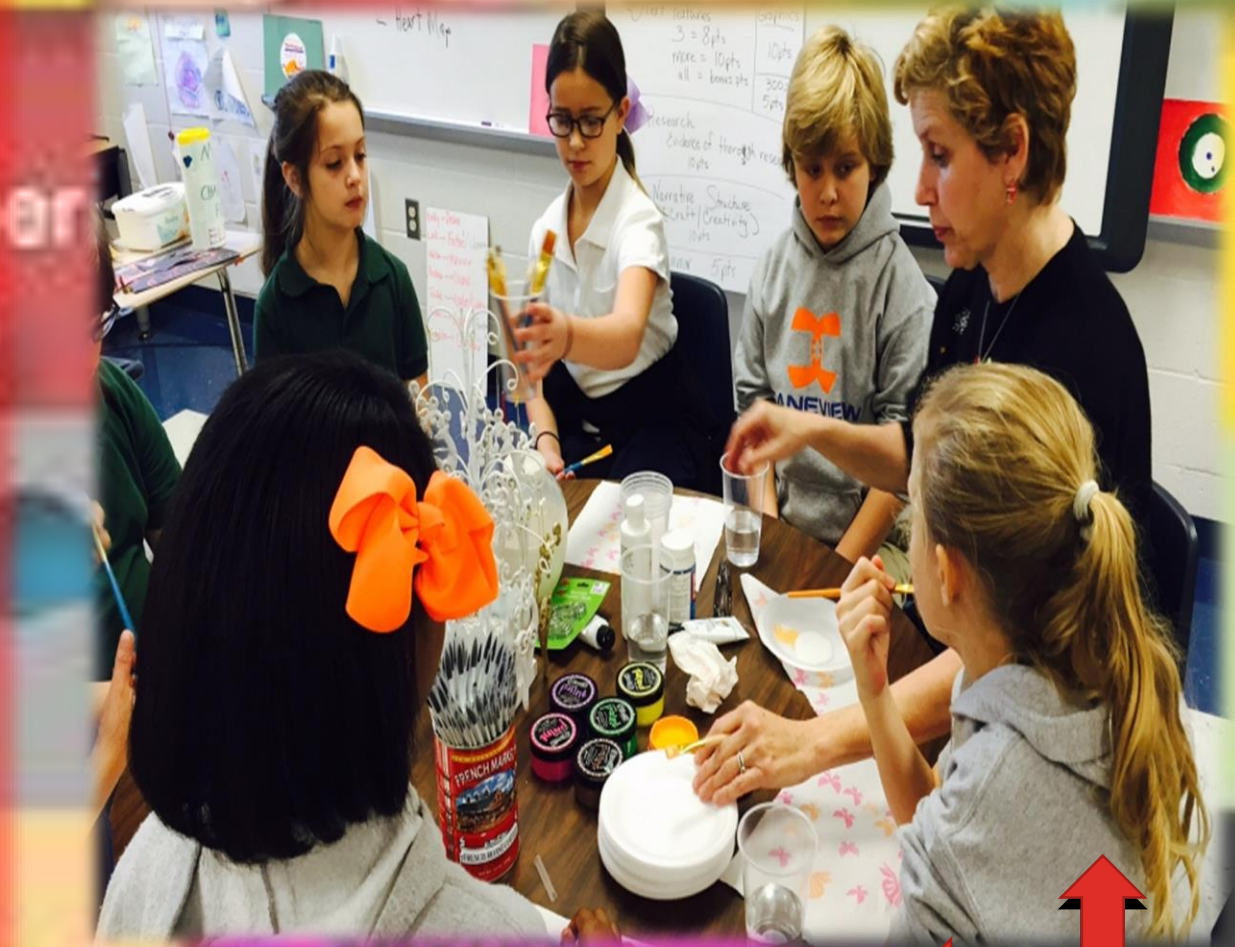
Diverse learners working together.