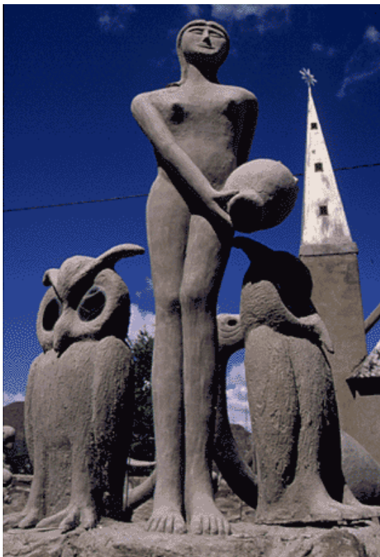
Sculpture of a woman pouring water in the “Camel Yard”.