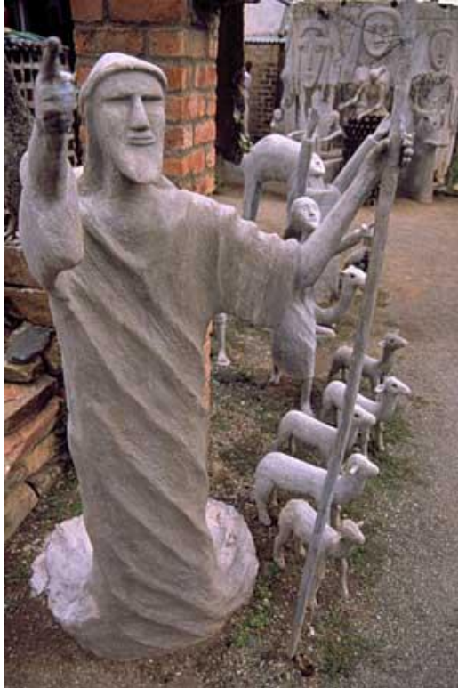
Sculptures in the “Camel Yard”.