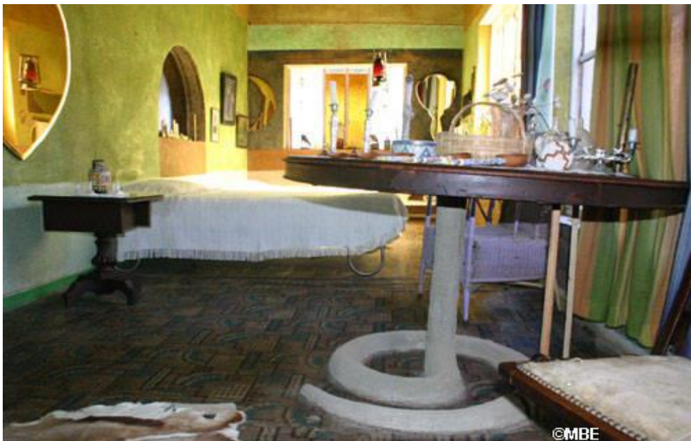
Helen's bedroom at the Owl House.

After the death of Martins's mother, she inherited a small house in the village. The Karoo desert is very dry all year round, cold in winter and hot in summer. Houses in the village were small, with low roofs. "The Owl House", as Helen Martins's house has become known, is typical of the architecture of the town. From the outside, the house looks exactly like any other house in an arid area. It is only when one enters it that one sees the extraordinary transformation that she brought about inside it. Look at the following picture of the interior of the house and of the yard, which Helen called "the Camel Yard":