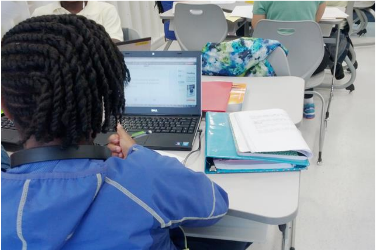
A student in a fifth grade class at Anne Beers Elementary School works on a computer lesson that allows her to move faster or slower than classmates in the same class.